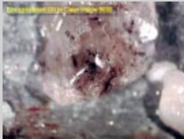
Oil in Halite

RIGWATCH Drilling Instrumentation DML Mudlogging Services PERC Morning Report Software RIGREPORT Morning Report Software